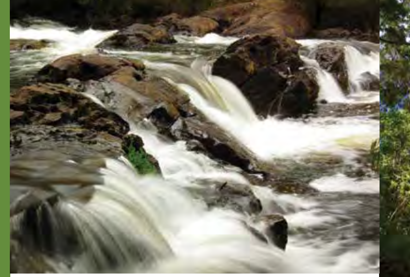
Above The Cascades. Right Riding through the karri forest.