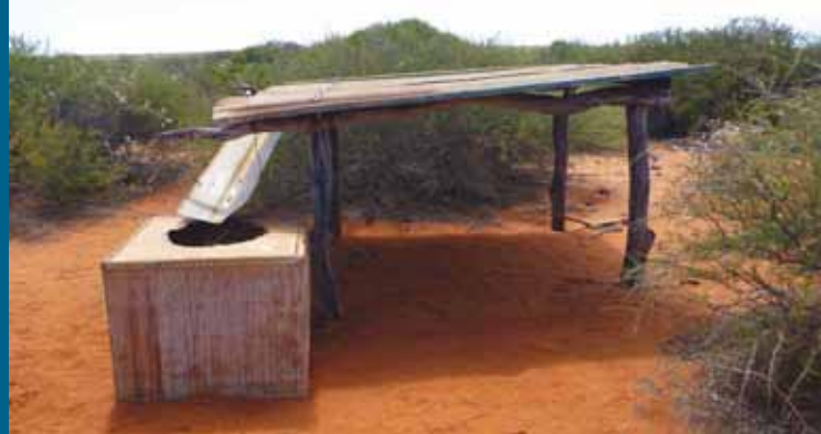
Above Kraskoe's Tank