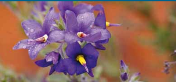
Below Halganias on red sand hills.