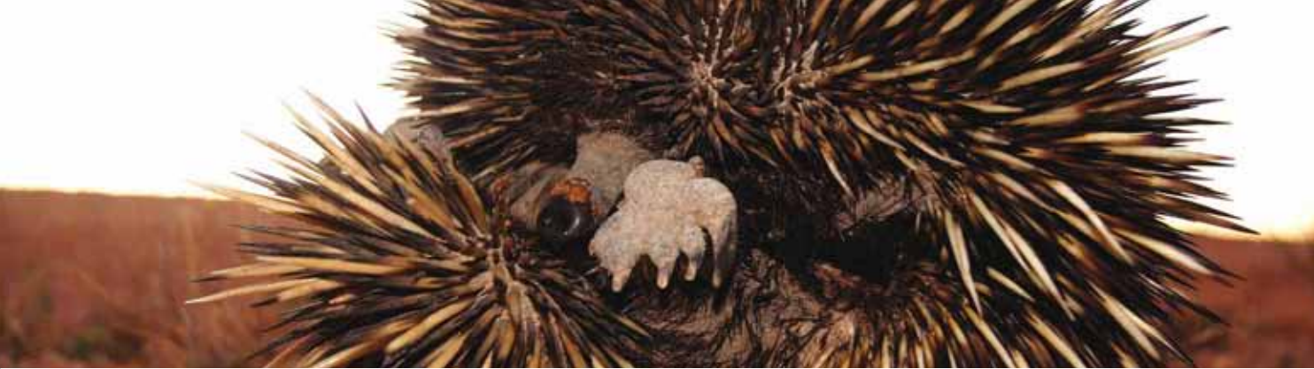
Above Watch out for echidnas on the road.