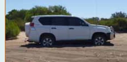
Above A four-wheel-drive vehicle bogged at Herald Bight.