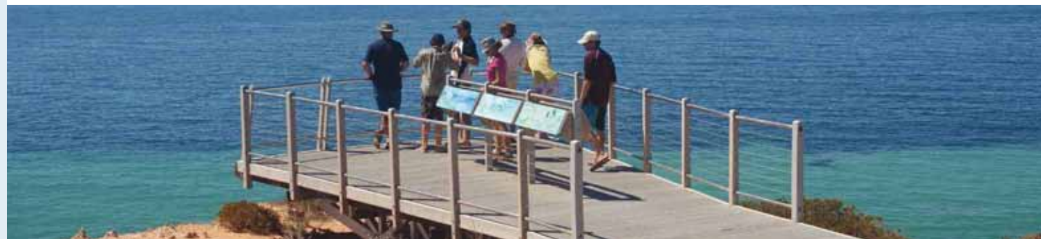
Below Lookout at Skipjack Point

Keep an eye out for the remains of a fish canning factory established in 1933 and converted to a fish freezer in 1938. The freezer was closed in 1947 when a new freezer plant was built in Denham.