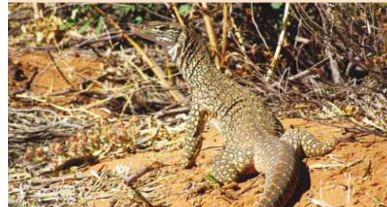
Below Bungarra (Gould's goanna).

Entrance and camping fees apply. A self-registration fee collection box is located at the park entrance off Monkey Mia Road. Your fees are used to maintain and develop park facilities.