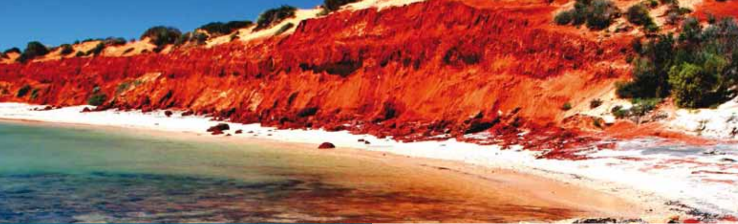
Above Bottle Bay.